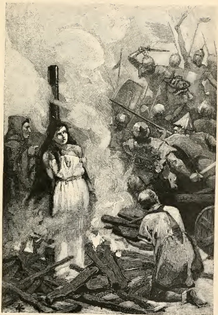
Queen Guenever's Peril.